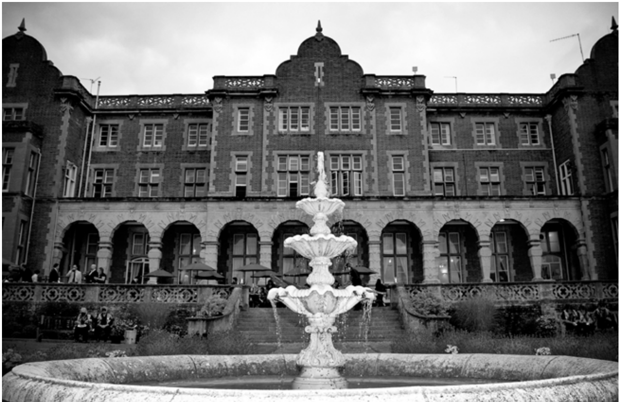
Easthampstead Park, Wokingham