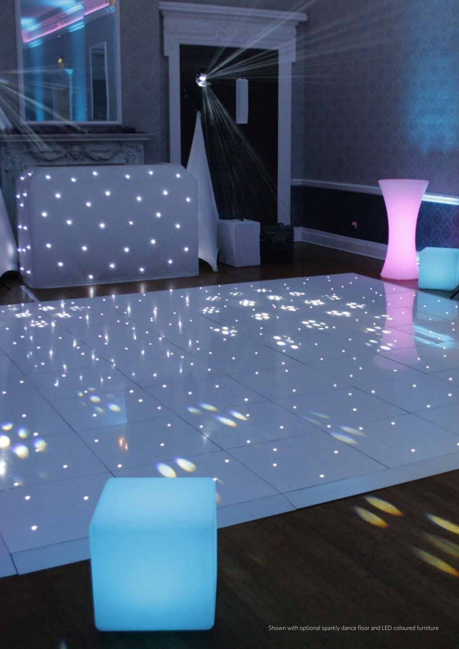
Shown with optional sparkly dance floor and LED coloured furniture